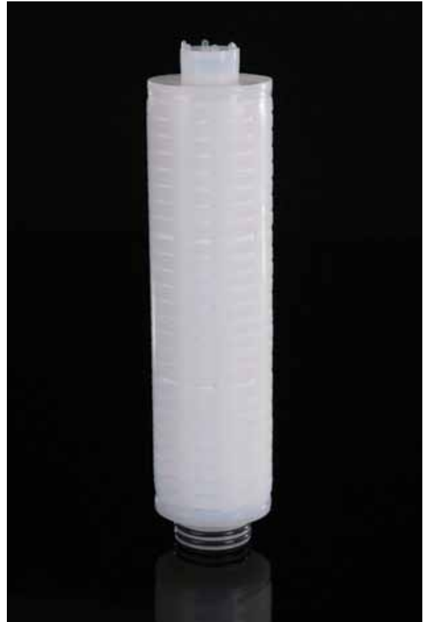
Note: TETPOR is a registered trademark of Parker domnick hunter